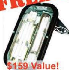
$159 Value! Buffer Light Kit