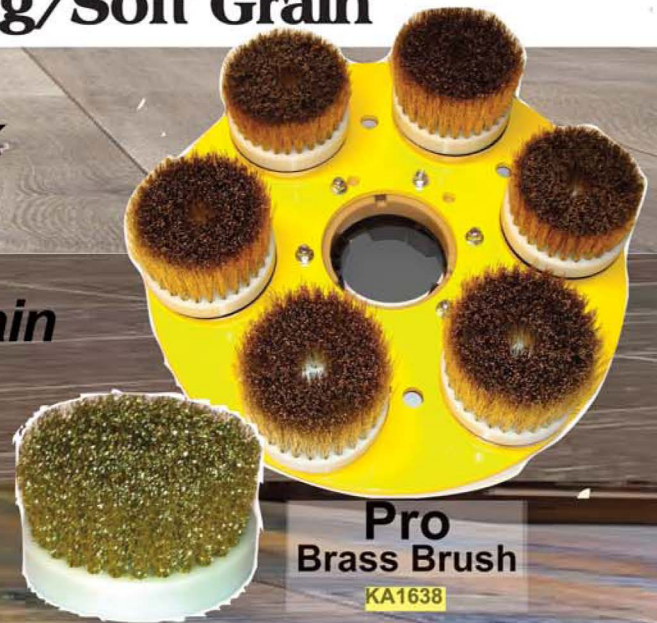
Pro Brass Brush KA1638

Heavy Distressed - Softens and Blends Scratches and Gouges