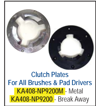
Clutch Plates For All Brushes & Pad Drivers

D01(Size) 12", 14", 15", 16", 17", 18", 19", 20", 21"