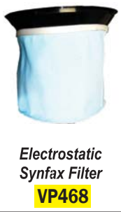
Electrostatic Synfax Filter VP468

Cleans filter while in use. Push button to reverse airflow, blowing dust off the filter into the tank.