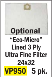
Optional "Eco-Micro" Lined 3 Ply Ultra Fine Filter 24x32 VP950 5 pk.