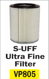
S-UFF Ultra Fine Filter VP805