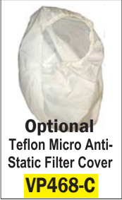
Optional Teflon Micro Anti-Static Filter Cover VP468-C