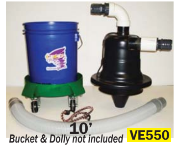
10' Bucket & Dolly not included VE550