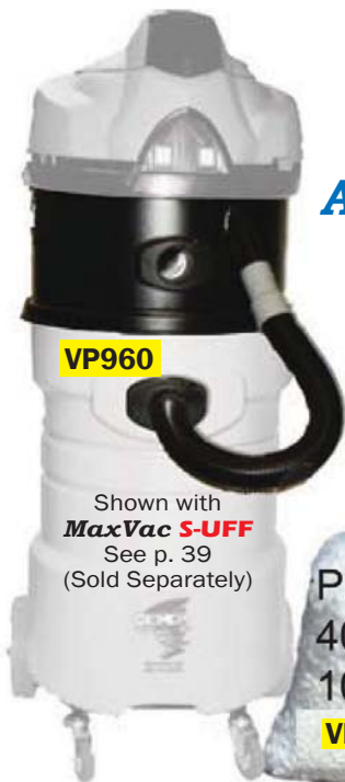
Shown with MaxVac S-UFF See p. 39 (Sold Separately)